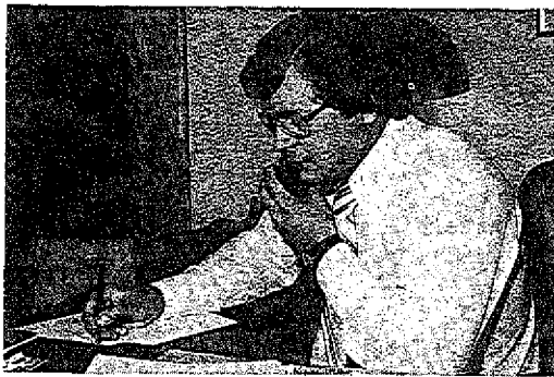
Ralph Goodale, Leader