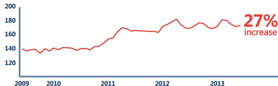
Energy Prices June 2009 to June 2013