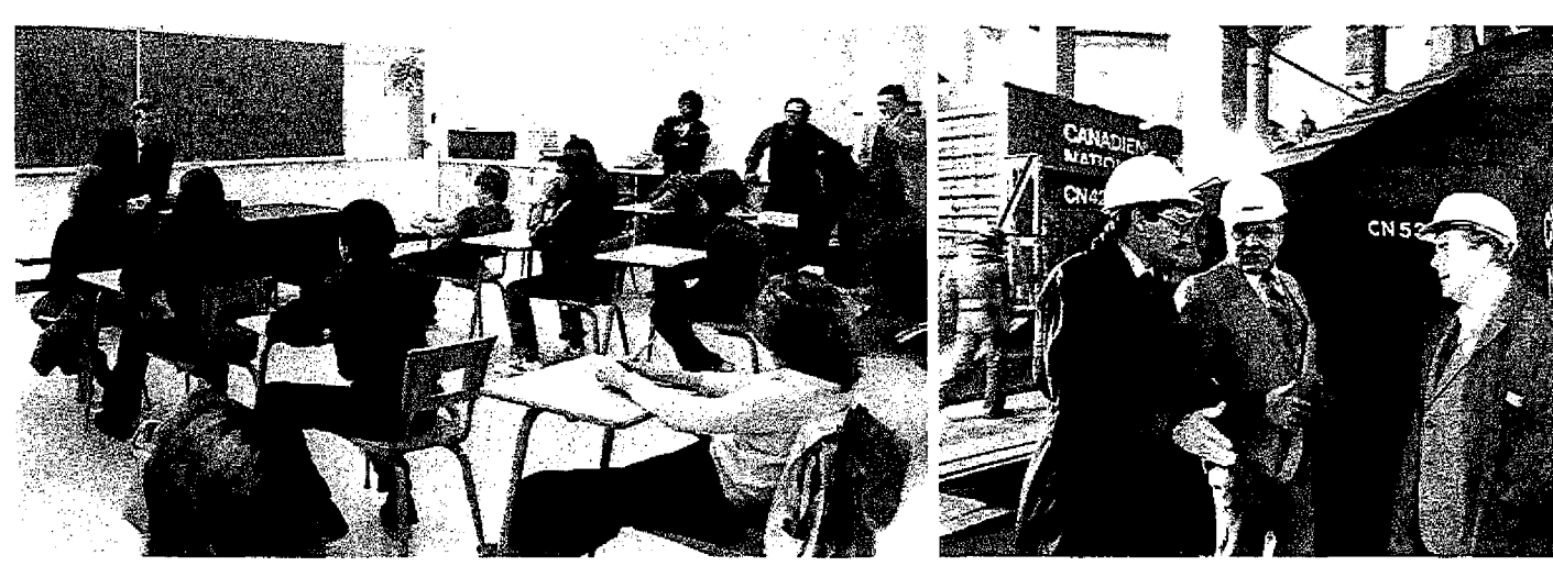
"I don't think anyone can spend time with our young people in Manitoba without becoming confident about our future in this province."