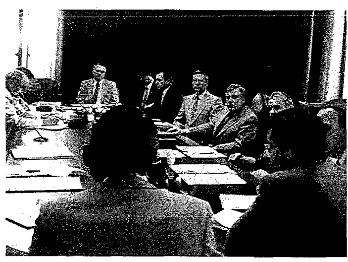
"I'm proud of the people who have made up our P.C. Government. Capable people with integrity and imagination. And with the new candidates we have in this election, we can offer Manitobans an even better government."

We've kept the promises we made in 1977. Today, every Manitoban pays lower taxes. And our economy is growing again. The economy created 30,000 new jobs in Manitoba in the last four years. And we've made government efficient again.