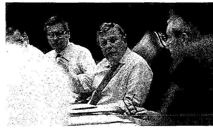
"It's just critically important that we negotiate the mega-projects in a way that will benefit all Manitobans."