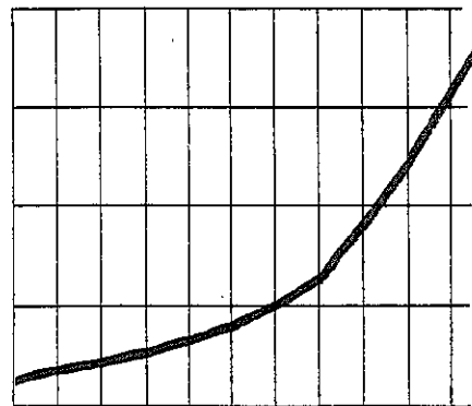
MUNICIPAL AID up over 5 times

The present government's assistance to cities, towns and municipalities represents a financial aid programme in step with the times.