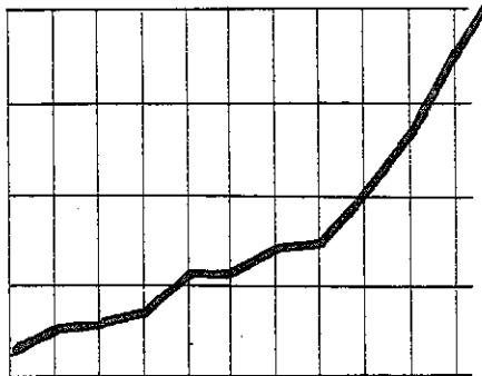
A GROWING BUDGET up almost 3 times

Efficient and sound financial planning by the present provincial government has made possible a steady increase in provincial services—$105 million will be spent in the coming year—up $67 million a year compared with 9½ years ago.