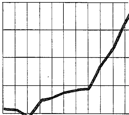
ROADS up 4 times

The present government has spent $214 million on Manitoba's road system in less than ten years of office.