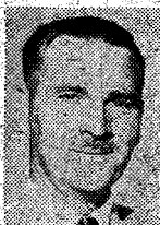
G. Rad COLUMBIA