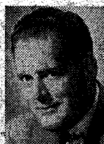
A. Gray COMOX