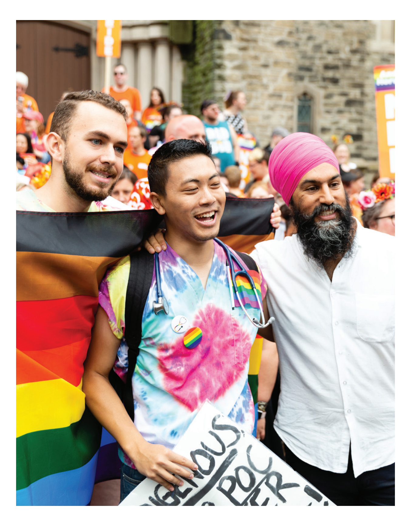
A NEW DEAL FOR PEOPLE: NEW DEMOCRATS' COMMITMENTS TO YOU