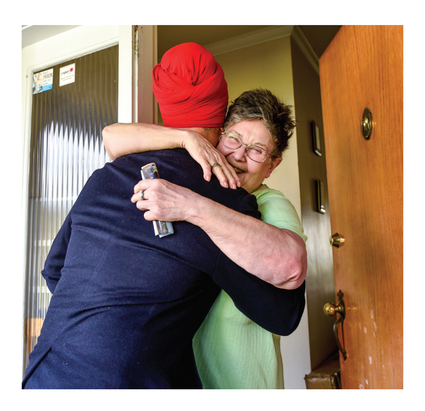
A NEW DEAL FOR PEOPLE: NEW DEMOCRATS' COMMITMENTS TO YOU

Canada is a leader in innovative health research, and we will work with universities and health professionals to make sure that public research on critical health issues continues to flourish. A New Democratic government will step up and regulate natural health products under stand-alone legislation.