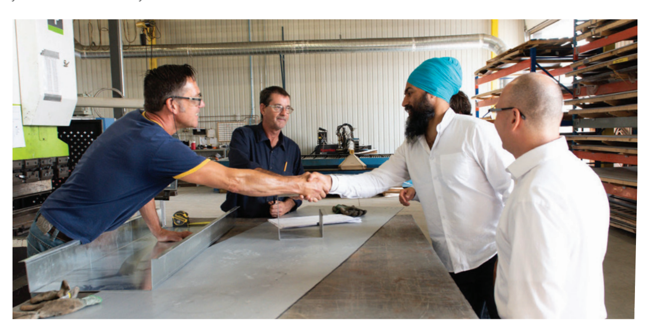
A NEW DEAL FOR PEOPLE: NEW DEMOCRATS' COMMITMENTS TO YOU

As a start, New Democrats will strengthen and modernize the Investment Canada Act to protect Canadian jobs and undo the damage done by the Liberal government, which has allowed more takeovers of Canadian companies by foreign investors without national security reviews. We'll scrap the failed Invest in Canada agency and create iCanada, a one-stop shop inside the federal government to help attract investors to Canada and turn their plans into reality – and champion Canadian industry on the international stage.