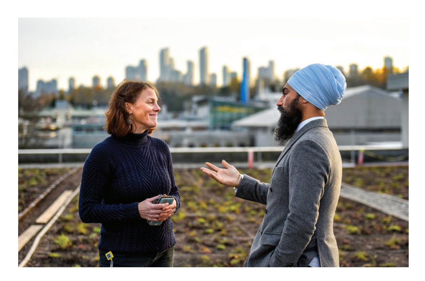
A NEW DEAL FOR PEOPLE: NEW DEMOCRATS' COMMITMENTS TO YOU

And finally, New Democrats will tackle obstacles to women's political participation by reforming the electoral system and introducing legislation to encourage political parties to run more women candidates.