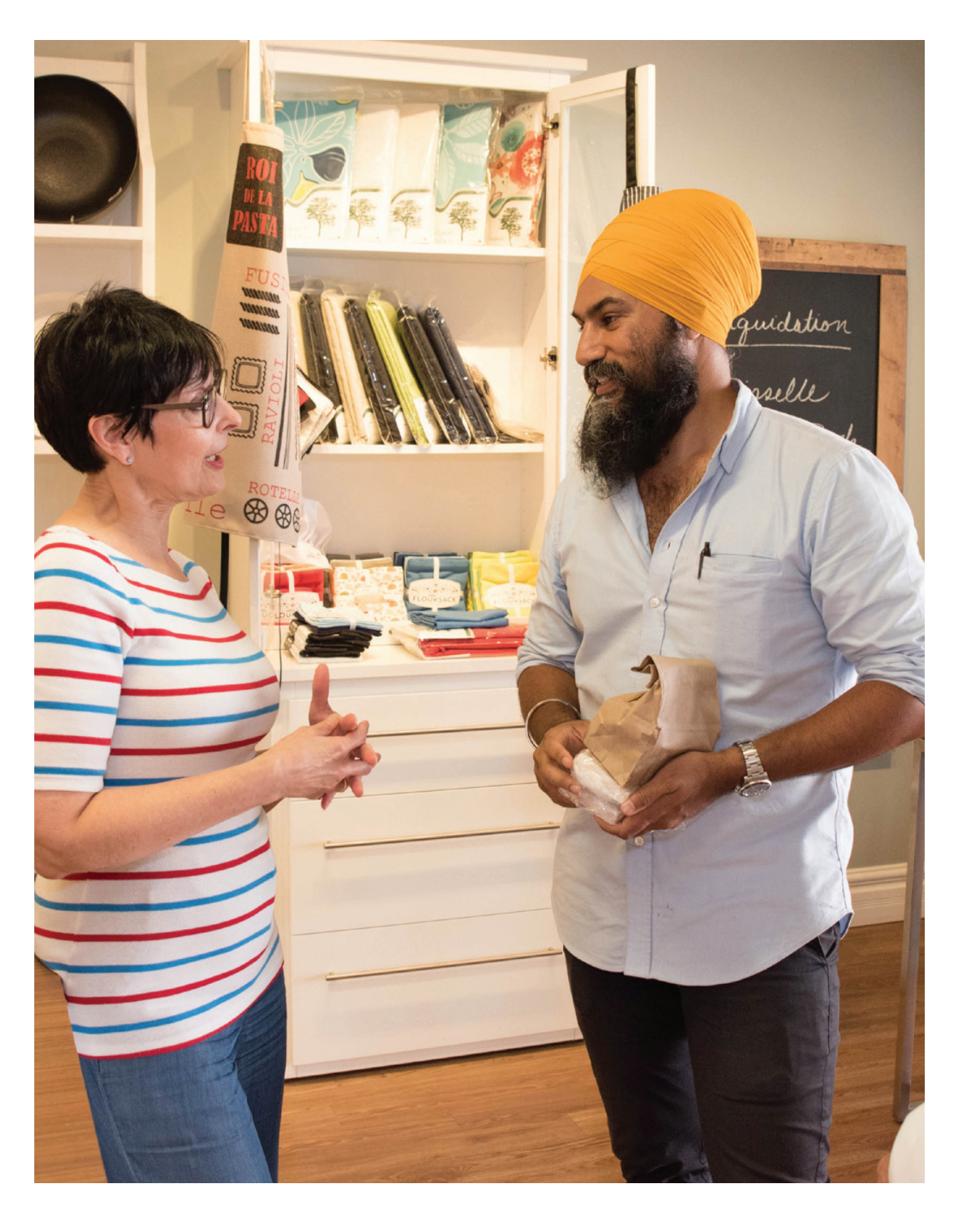
A NEW DEAL FOR PEOPLE: NEW DEMOCRATS' COMMITMENTS TO YOU