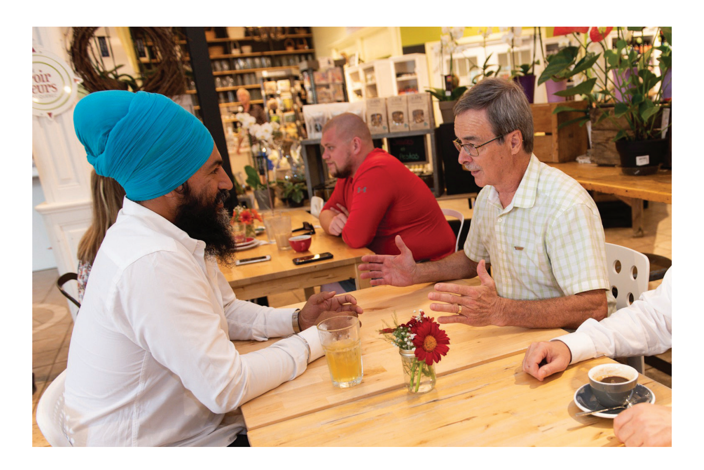
A NEW DEAL FOR PEOPLE: NEW DEMOCRATS' COMMITMENTS TO YOU

We'll also introduce an ethical social and environmental screen on government procurement, so that Canadians can be confident that their tax dollars are not going to pay for bribes in foreign countries or pollution that we'll all have to pay to clean up later. Finally, we will empower the Auditor General to review taxpayer-funded government advertising to make sure that it is non-partisan.