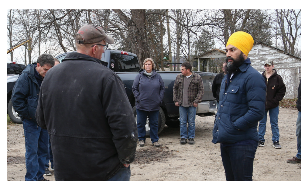
A NEW DEAL FOR PEOPLE: NEW DEMOCRATS' COMMITMENTS TO YOU

It's time to make different choices. It's time for a government that's actually working on the side of Canadian farmers, producers, and farm families.