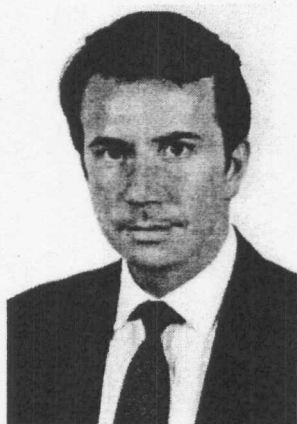
Scott Brison PC Finance Critic Member of Parliament for Kings-Hants