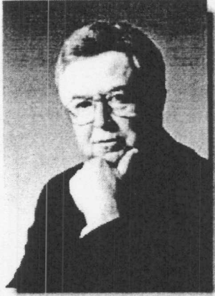
PC Leader Rt. Hon. Joe Clark

"Economic growth is the means to achieve all other goals we might set for our society. It is the key to unlocking Canada's potential"