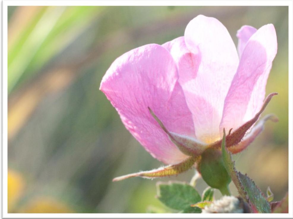
Front & Back Cover